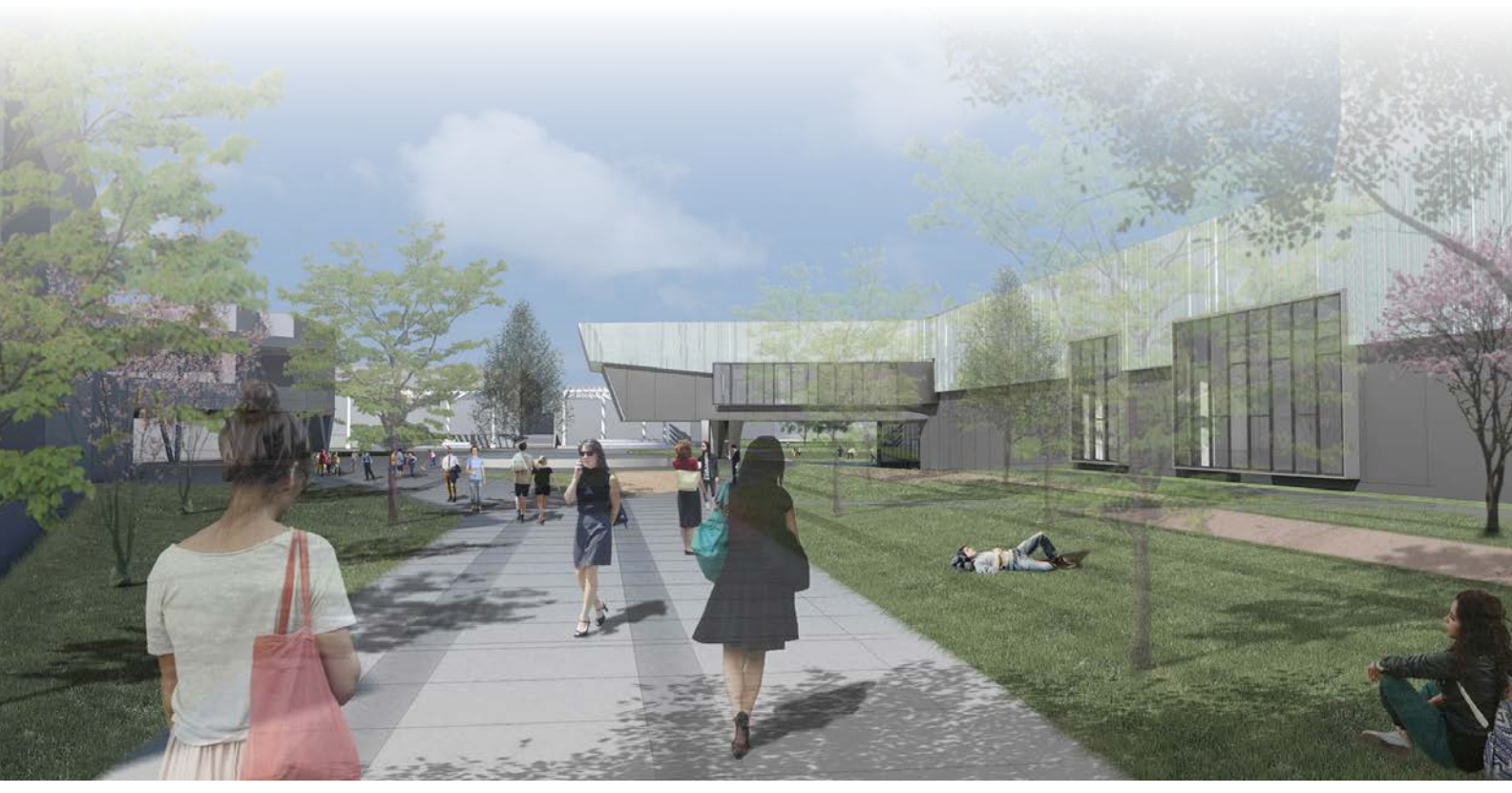
Performing Arts Center rendering

Thanks to voter-approved funds from Measure CC (2004) and Measure G (2012), the College continues its transformation to upgrade the campus with modern facilities and resources. The College is committed to developing the best student-learning environment featuring energy efficient and sustainable designs.