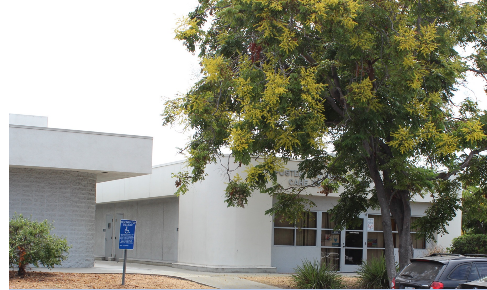
Community / Adult Education Foster Kinship Care 1980s - <25% FCI